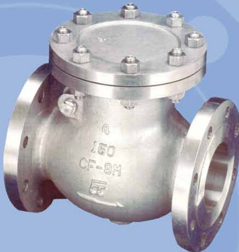
FIG. 45-300, STAINLESS STEEL - CLASS 300

FIG. 45-150, STAINLESS STEEL - CLASS 150