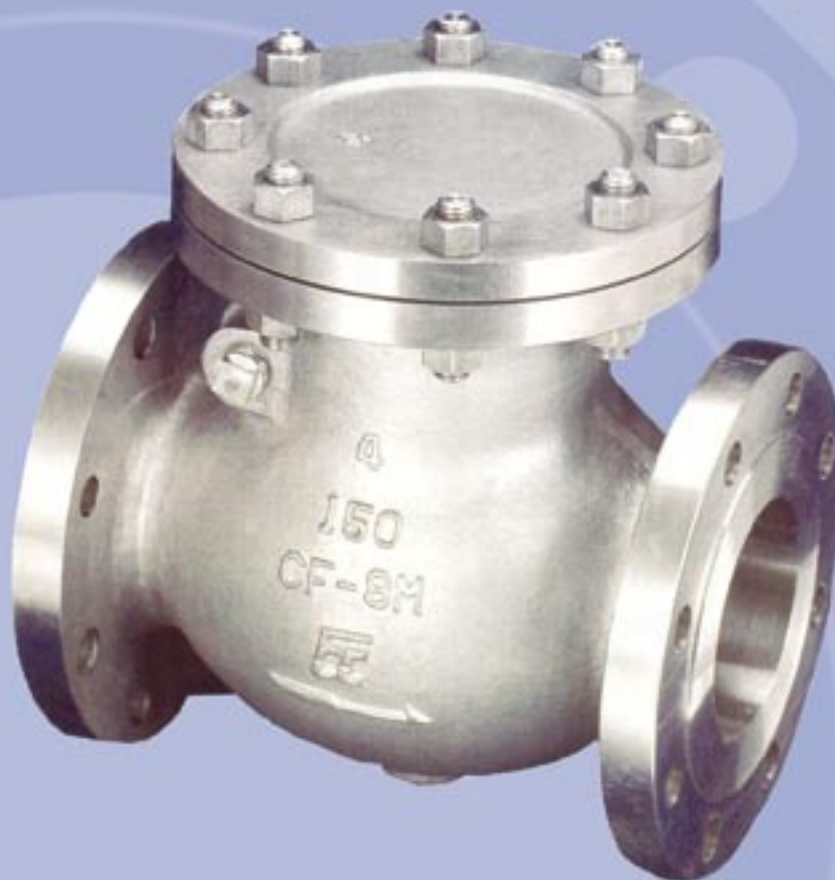
FIG. 45-300, STAINLESS STEEL - CLASS 300

FIG. 45-150, STAINLESS STEEL - CLASS 150