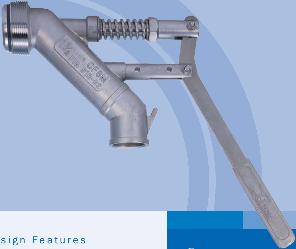
FIG. NO. 51B (CF8M) RESILIENT SEAT - LEVER OPERATED