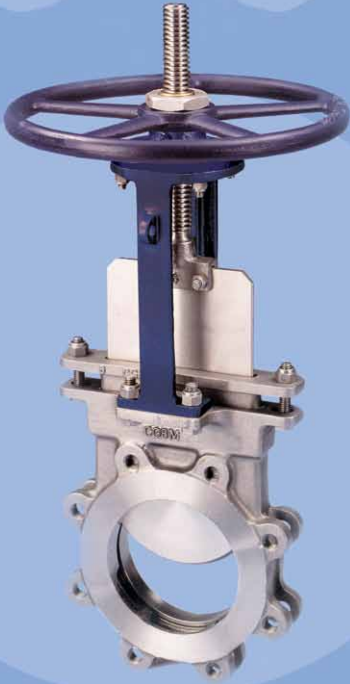
FIG. 73, STAINLESS STEEL WITH D.I. TOPWORKS - FULL PORT - UNI-DIRECTIONAL METAL TO METAL SEAT