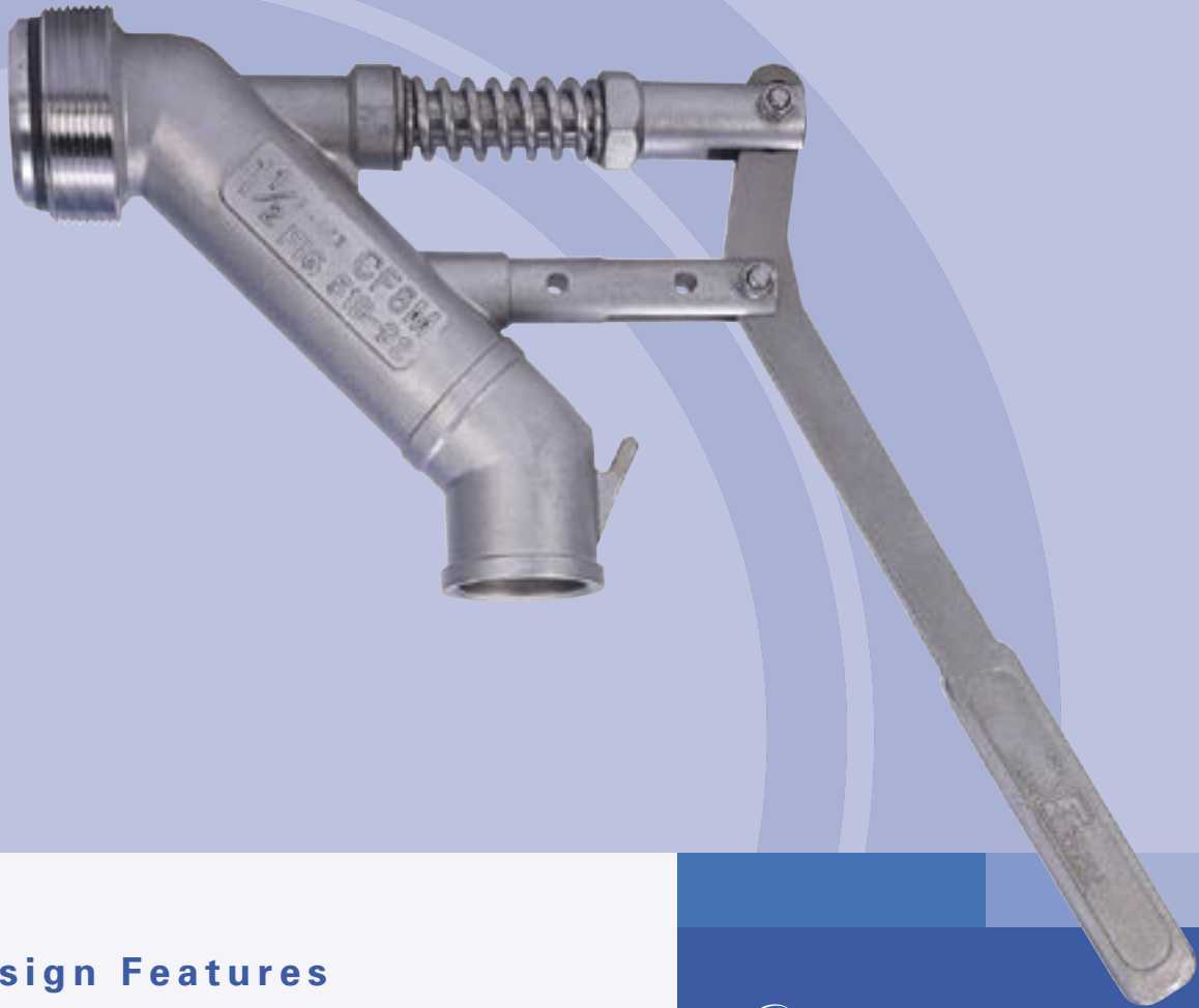
FIG. NO. 51B (CF8M) RESILIENT SEAT - LEVER OPERATED