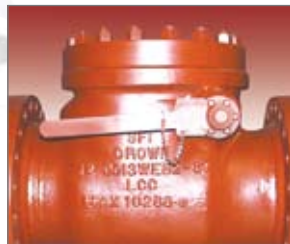
lock open lever