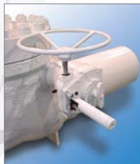
worm gear operator